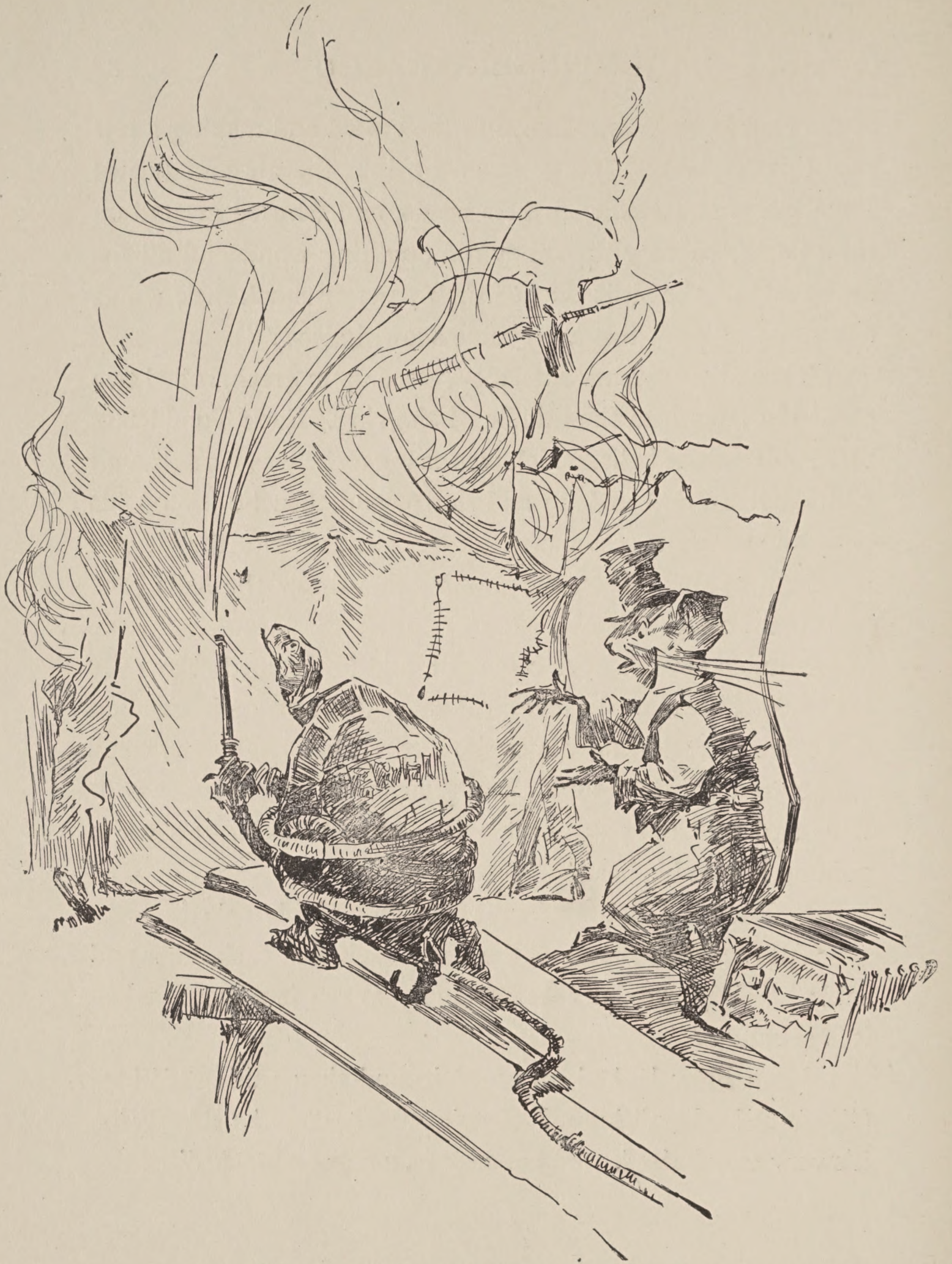
CHURCH MOUSE'S CIRCUS BURNS.